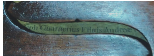
Fig. 3 The writing on the label as seen through the f-holes. It reads "Joseph Guarnerius Filuis Andreae Cremonae Sub Titulo S. Theresie, 1705", where the two final digits would appear to have been added later

However, this does not necessarily mean that the violin was made by the famous luthier. In order to prove