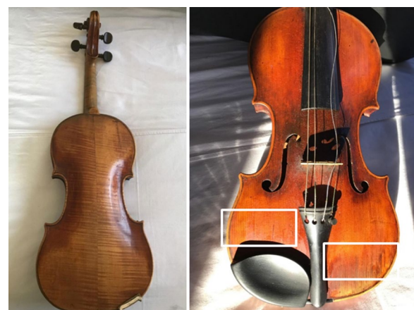
Fig. 1 Initially, the original photos of the violin above, sent by WhatsApp, were used for dendrochronological dating. On the right, in the white rectangles, the rings measured during the first dating are clearly visible, with the violin still bearing the chinrest and tailpiece

Then the principal dendrochronological parameters were calculated such as: mean ring width (MV), standard deviation (SD), mean sensitivity (S) and first-degree autocorrelation (A). MV and SD make an instrument unique because they may influence sound quality [9, 10]. The standard deviation, in particular, indicates the dispersion of data around the mean and is considered an indication for regular annual growth [11]. Mean sensitivity, S, shows how the tree reacted to environmental changes, whilst first-degree autocorrelation, A, indicates to what extent the formation of one ring depends on the width of the preceding ring [12]. After dating the instrument, \Delta t was calculated, which indicates the difference, in years, between the date shown on the violin's label and